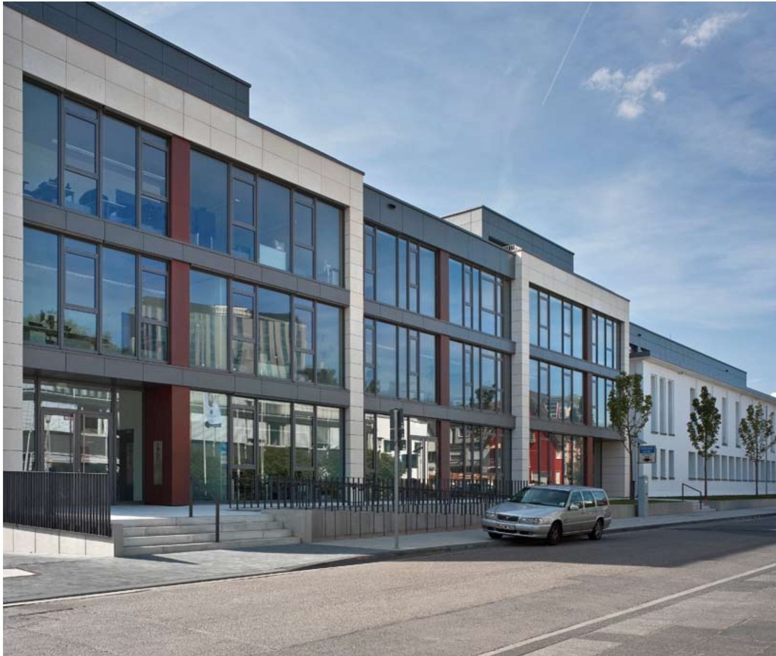
↑ | Façade , entrance area on Schlegelstraße → | Façade , facing Willy-Brandt-Allee

Address: Willy-Brandt-Allee 11, 53113 Bonn, Germany. Client: Art-Invest Real Estate, Cologne, Pareto GmbH, Cologne. Completion: 2012. Gross floor area: 18,100 m 2 . Landscape architects: RMP Landschaftsarchitekten, Bonn. Main materials: lime stone, aluminum façade elements, cupreous panels. Number of work stations: 350. Ventilation: geothermal energy, cooling ceiling. Types of offices: individual, group, business club, moveable walls. Conference rooms: 15/60 people. Setting: urban.